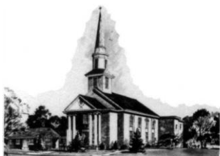
The Historic "Old White Church" Serving Christ Since 1675

Non-Profit Organization U.S. POSTAGE PAID Rahway, NJ 07065 PERMIT NO. 522